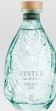
OYSTER Adriatic Gin