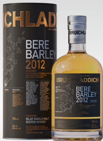
BRUICHLADDICH Bere Barley