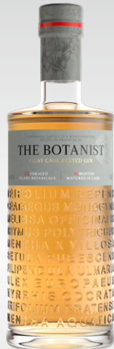
THE BOTANIST Cask Rested Dry