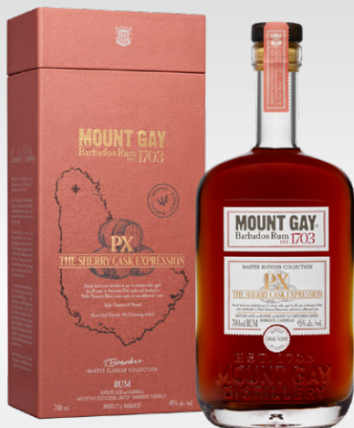
MOUNT GAY Master Blender Collection Sherry Cask Expression