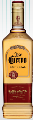
JOSE CUERVO Especial Reposado