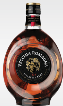
VECCHIA ROMAGNA Etichetta Nera