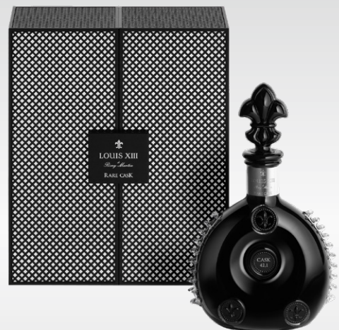
LOUIS XIII Rare Cask 42.1