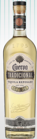
JOSE CUERVO Tradicional Reposado