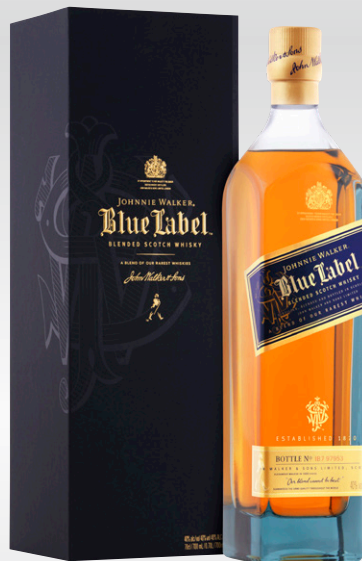
JOHNNIE WALKER Blue Label