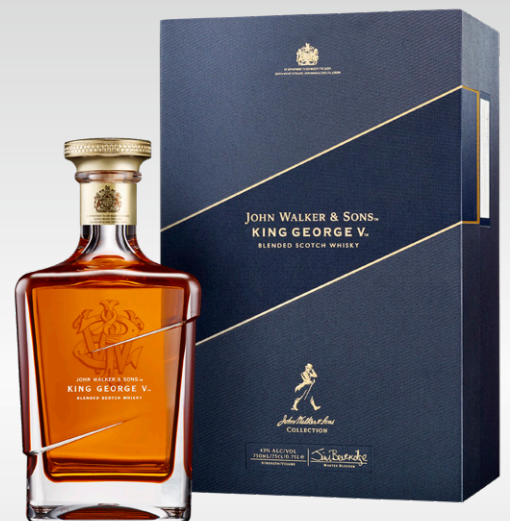
JOHN WALKER & SONS King George V