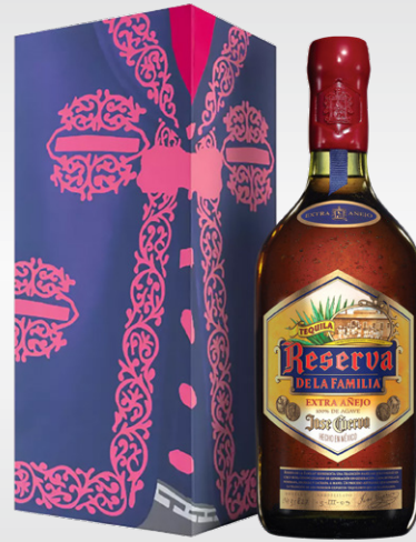
JOSE CUERVO Reserva de la Familia Extra Añejo