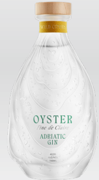
OYSTER Adriatic Gin Wild Citrus