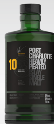
PORT CHARLOTTE Aged 10 Years