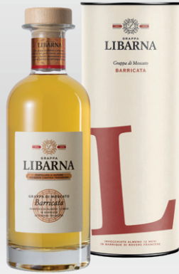
GRAPPA LIBARNA Moscato