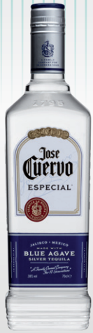
JOSE CUERVO Especial Silver