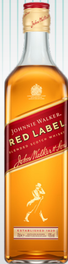
JOHNNIE WALKER Red Label