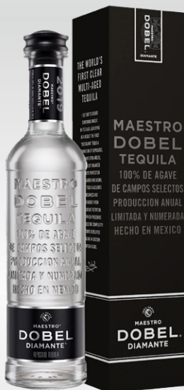
MAESTRO DOBEL Diamante