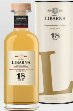
GRAPPA LIBARNA Barbera e Dolcetto