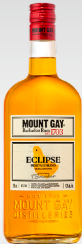
MOUNT GAY Eclipse