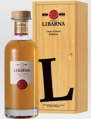
GRAPPA LIBARNA Barolo