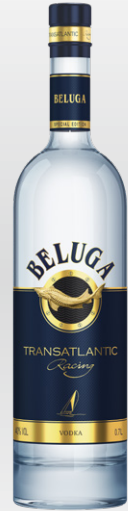
BELUGA Transatlantic Racing