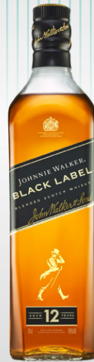
JOHNNIE WALKER Black Label