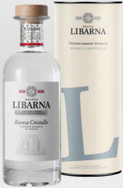
GRAPPA LIBARNA Bianca