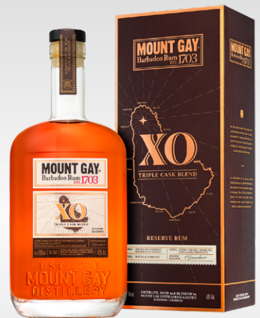
MOUNT GAY XO