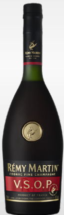
RÉMY MARTIN VSOP