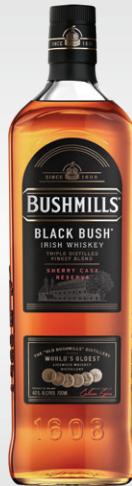
BUSHMILLS Black Bush