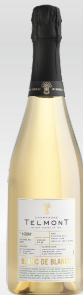
TELMONT Blanc de Blancs 2014