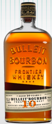
BULLEIT Bourbon Aged 10 Years