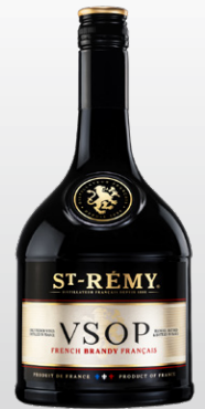
SAINT RÉMY VSOP