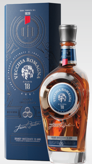
VECCHIA ROMAGNA Riserva 18 Anni