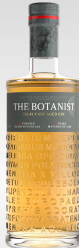
THE BOTANIST Cask Aged Dry