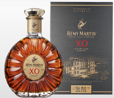
RÉMY MARTIN XO