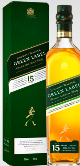
JOHNNIE WALKER Green Label