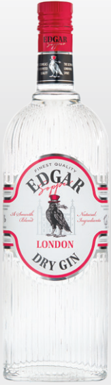
EDGAR SOPPER London Dry Gin