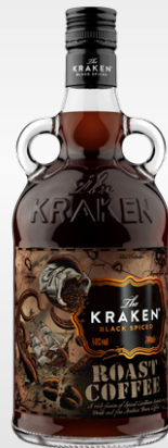
KRAKEN Roast Coffee