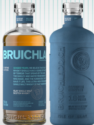
BRUICHLADDICH Aged 18 Years