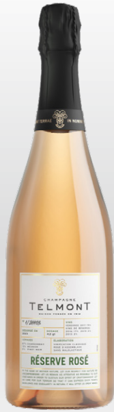
TELMONT Réserve Rosé