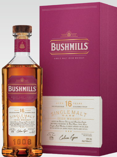
BUSHMILLS Aged 16 Years