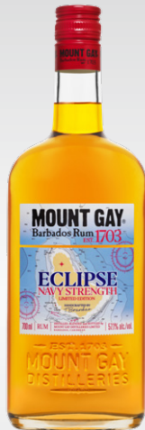
MOUNT GAY Eclipse Navy Strength