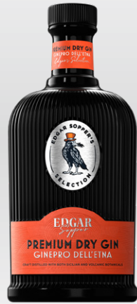
EDGAR SOPPER Premium Dry Gin