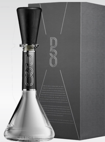
MAESTRO DOBEL Cristalino 50