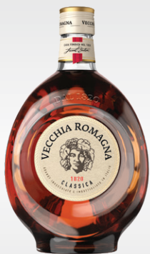
VECCHIA ROMAGNA Classica