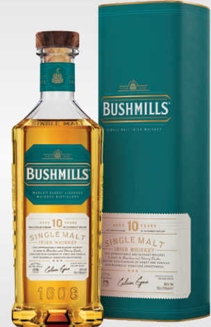
BUSHMILLS Aged 10 Years