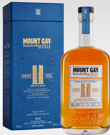
MOUNT GAY Master Blender Collection Coffey Still Expression