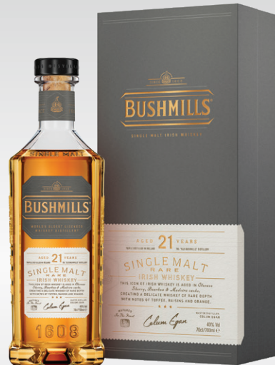
BUSHMILLS Aged 21 Years