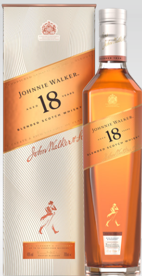
JOHNNIE WALKER Aged 18 Years