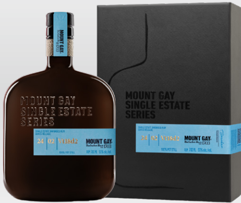
MOUNT GAY Single Estate Series 24_02