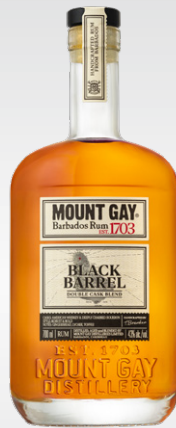
MOUNT GAY Black Barrel