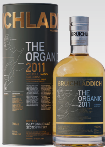
BRUICHLADDICH The Organic