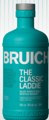
BRUICHLADDICH Classic Laddie