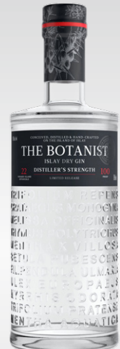
THE BOTANIST Distiller's Strength