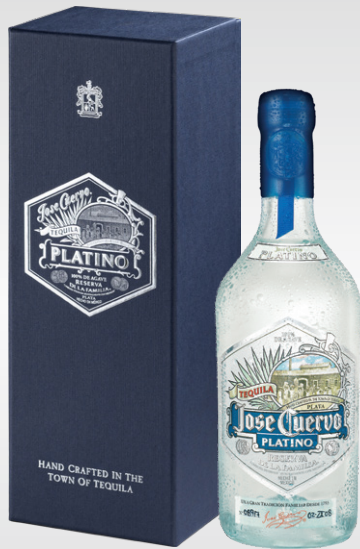
JOSE CUERVO Reserva de la Familia Platino