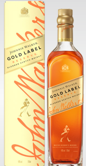
JOHNNIE WALKER Gold Label Reserve