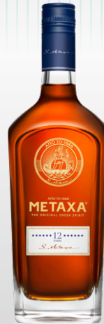
METAXA 12 Stars