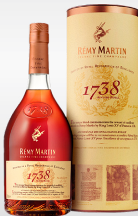
RÉMY MARTIN VSOP 1738