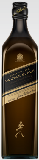
JOHNNIE WALKER Double Black