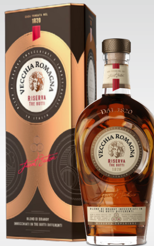
VECCHIA ROMAGNA Riserva Tre Botti