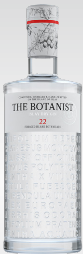
THE BOTANIST Islay Dry