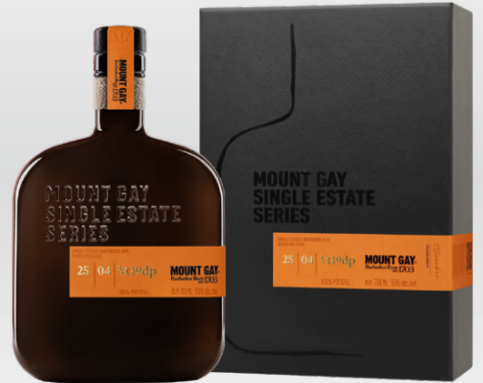
MOUNT GAY Single Estate Series 25_04