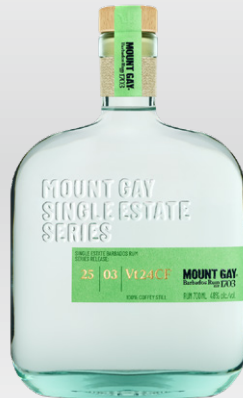
MOUNT GAY Single Estate Series 25_03