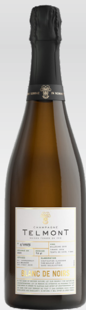
TELMONT Blanc de Noirs 2015