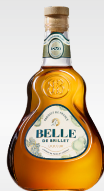
BELLE DE BRILLET