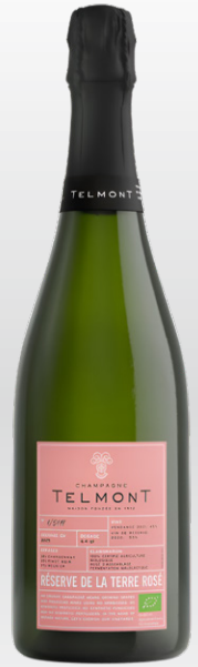
TELMONT Bio Réserve De La Terre Rosé