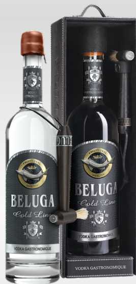
BELUGA Gold Line