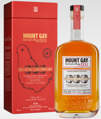
MOUNT GAY Master Blender Collection Cognac Cask Expression