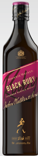
JOHNNIE WALKER Black Ruby